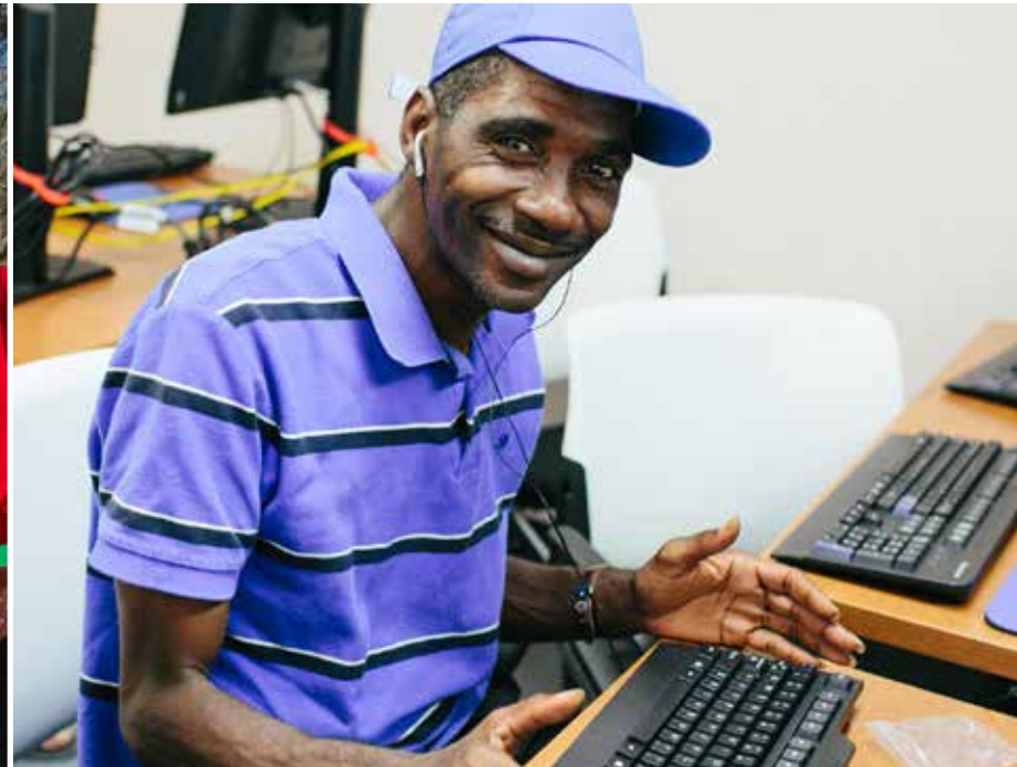
Residents gain confidence and self-worth when they learn the skills they need to find a good job. They know that that's what it takes to become independent and self-sufficient.